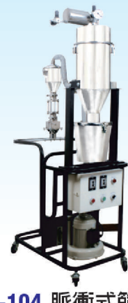
● CS-104 脈衝式篩粉機 (針對大小顆粒分離)