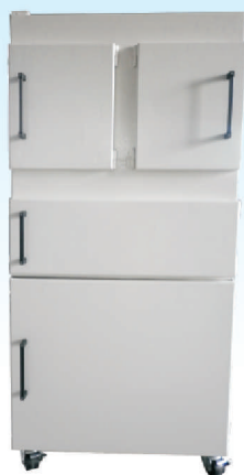
● NS-502 高壓或透浦式集塵機 (可移動、抽屜式設計)