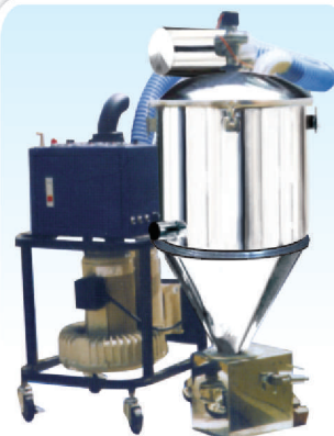
● CS-350 自動吸粉、料機 (粉末、顆粒皆可輸送)