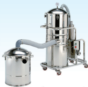
防爆集塵機 ● CS-103 移動式集塵機 (針對低燃點、溫度高)