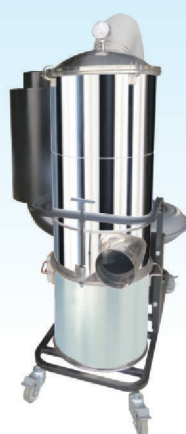
● CS-105 油霧處理機 (油氣回收)