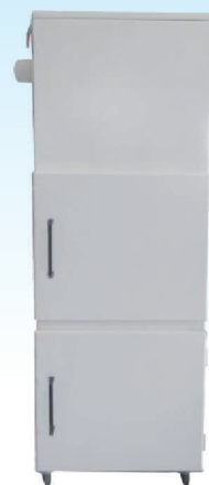
● NS-503 高壓或透浦式集塵機 (可移動、垃圾袋設計)