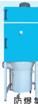
防爆集塵機 ● NS-750 透浦式集塵機 (自動吹撥濾心、大風量)