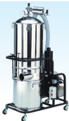
● CS-102 移動式集塵機 (自動逆衝濾心配備)

石墨、纖維、食品、鎂合金、鋁合金、碳粉、藥品、鐵屑、廢氣或油霧等任何粉塵皆適用。 24小時免停機。品質不輸進口。88年設立至今，始終堅持品質穩定，服務客戶為最重要指標。 郁錫為最專業集塵機製造商 食品、藥廠、半導體、機械廠最愛