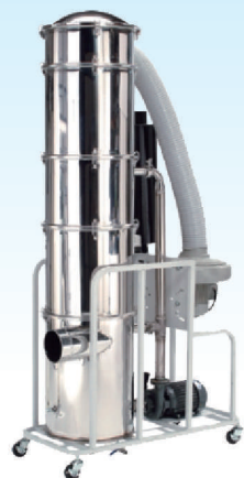
● CS-106 廢氣處理機 (針對各種味道消除)